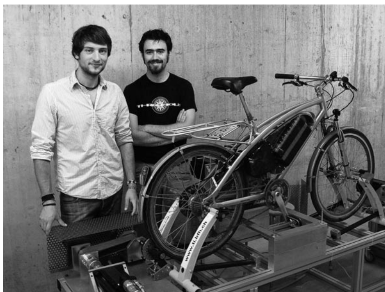
The E-Bike on the test bench

E-Bikes are experiencing an increase in popularity. The combination of human and electric power allows higher speed and a bigger range. The Dolphin iZip express, best rated in the E-Bike test of the consumer magazine "Kassensturz", has been sold successfully in Switzerland for several years. Developer Dolphin E-Bikes GmbH has now found a distribution partner in the USA. The E-Bike company iZip has agreed to finance a redesign of the Dolphin iZip express. The aim of our Bachelor-Thesis was to design a fully digital battery management system and motor controller unit.