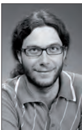
Christ Andri Hassler

This Bachelor thesis covers a complete technical redesign of the Powerbox for the Off-Grid SunbagL. The Powerbox specifications are as follows: energy storage capacity of around 50Wh, input power 2W to 20W, input voltage range 4V to 19V DC or AC, maximum output current 4.5A, output power available between 5V and 19V.