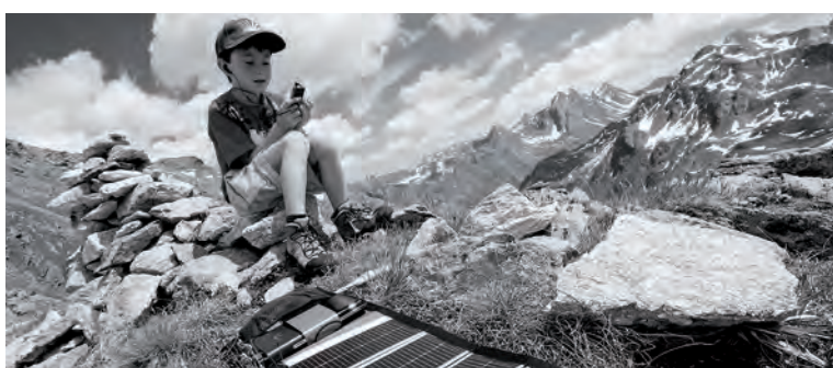
Powerbox Sunbag L in use.